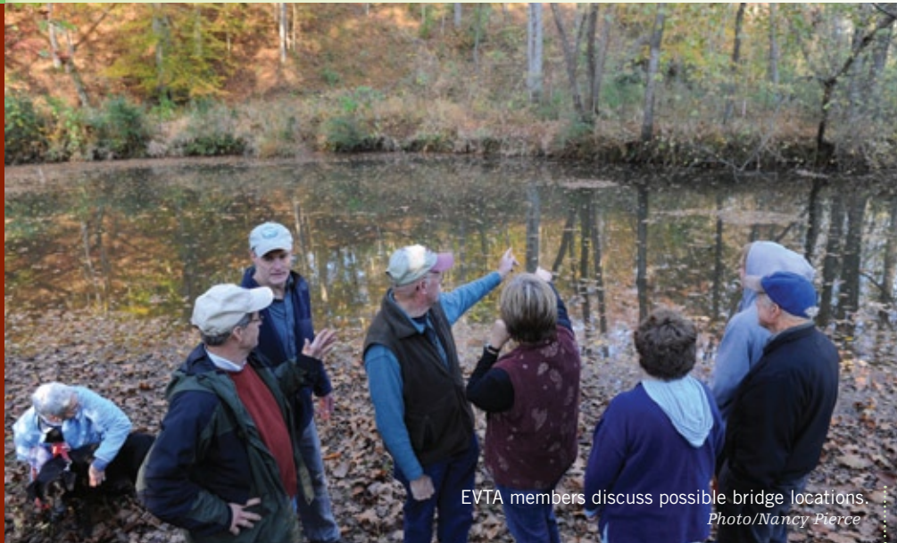
EVTA members discuss possible bridge locations.