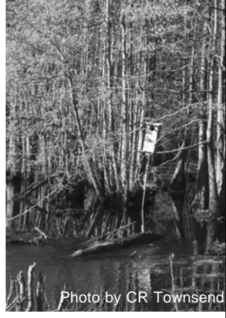
Austin Fitchett of Boy Scout Troop 711 built the blue bird box (left) and wood duck box (right) on the Dunn-Erwin Rail-Trail as part of requirements for Eagle Scout.